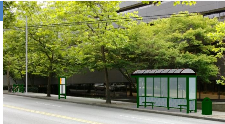
New trolley wires and passenger amenities at Second Avenue and Denny Way will improve transit along the corridor